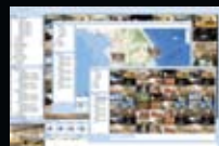
CMS Live Monitor